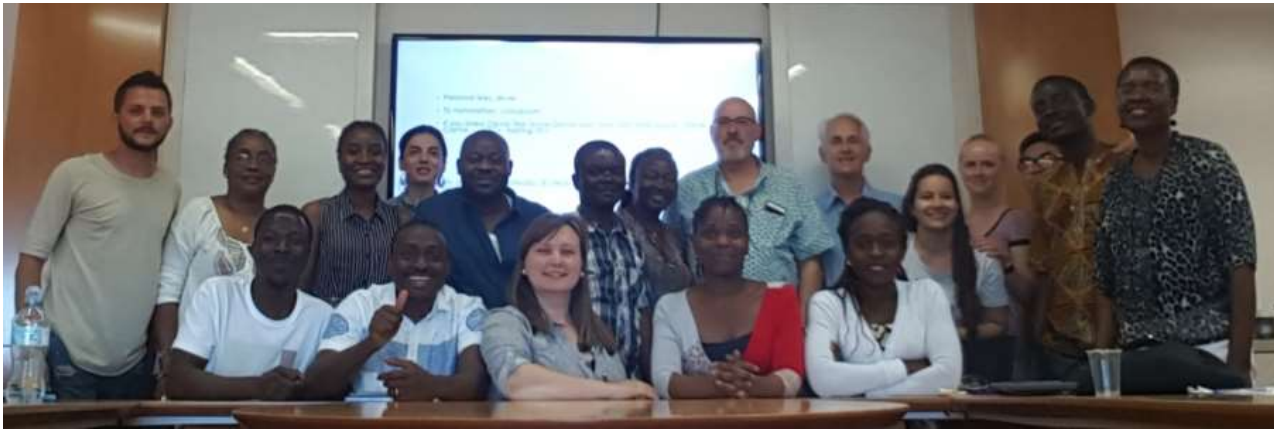
Meeting of IECD TF Berlin

At the conference, the Task Force advocated to ensure children-on-the-move, especially those with disabilities, are supported, protected, and educated with full upholding of their rights as articulated in both the Convention of the Rights of the Child (CRC) and the Convention on the Rights of Persons with Disabilities (CRPD). As the Chair of the Task Force highlights, "All policies, programs, and practices should reflect the SDG commitment that "no one be left behind" and that the particular needs and rights of children with disabilities will be addressed with inclusive, accessible, and effective health, education, ECD, and protection. Among children-on-the-move, those with disabilities, as well as those who will be disabled by the diverse threats and risks in their journeys, comprise a most vulnerable group of children, a priority population to whom our commitment cannot falter or attenuate. The scientific, economic, and political cases support an inclusive early childhood development framework for achieving these goals."