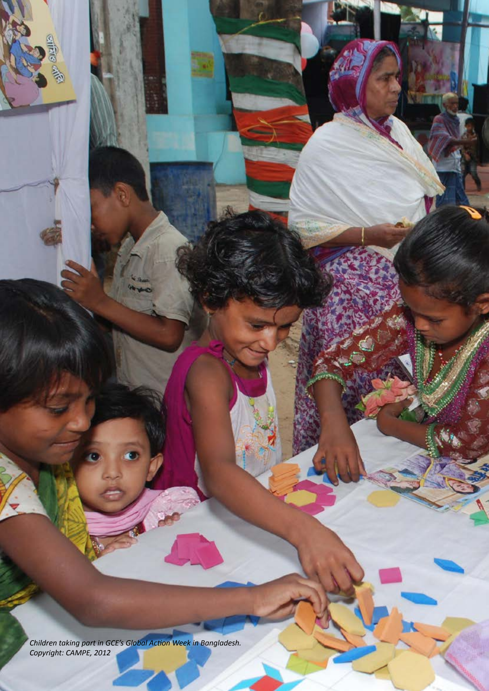
Children taking part in GCE's Global Action Week in Bangladesh.