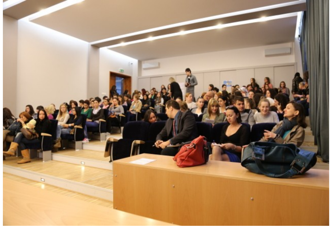
Figure 3: Train-the-trainer workshops for teachers at the High school for the Blind, Timisoara, Romania, October 2013

Figure 2: Presenting RoboBraille and Inclusion Technology to students and faculty at West University, Timisoara, Romania, October 2013_____