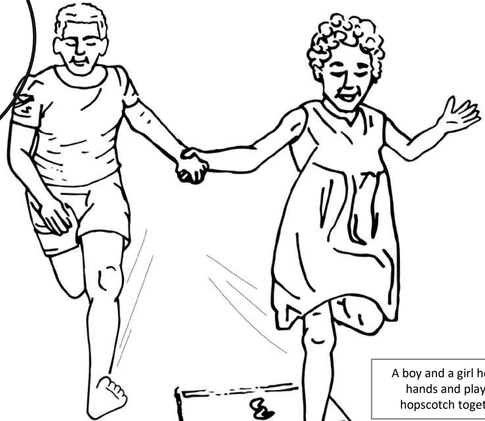
A boy and a girl holding hands and playing hopscotch together.