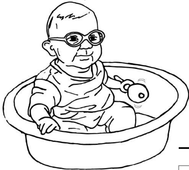
Young child wearing glasses sitting in a large bowl with a toy within easy reach; child is holding and shaking a sound toy.